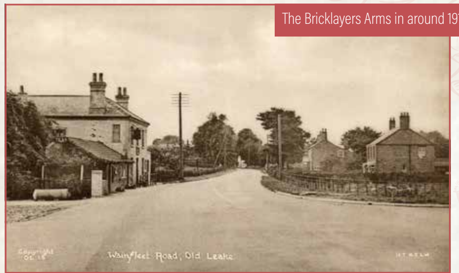
The Bricklayers Arms in around 1915