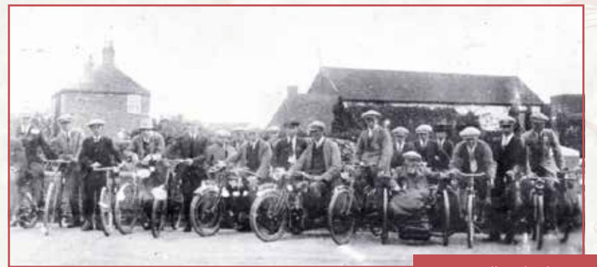
Motorcyclists in the 1930s